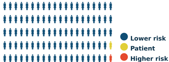
Figure 1: The patient's breast cancer polygenic risk position compared to other women of the same age.

AnteBC test considers the patient's nationality, gender, age, and the demographic background of breast cancer. The patient's risk of developing breast cancer within the next 10 years is 1.29% (1.09–1.51%). About 129 women out of 10,000 will develop the disease.